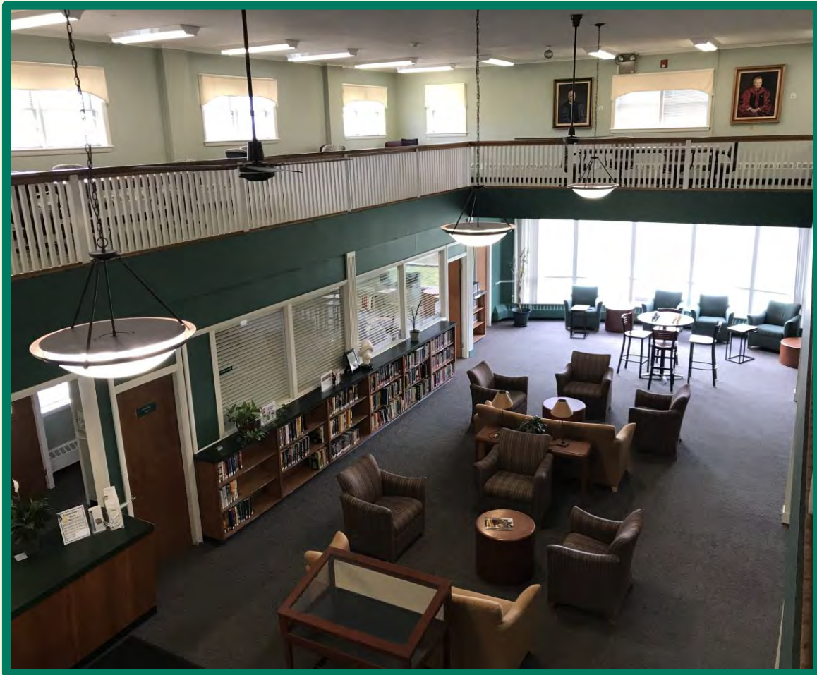
Photo of the mezzanine in 2018

In the 1990s, an ever-expanding number of computers for students were introduced and the first of seven group study rooms were added to the library in the early 2000s.