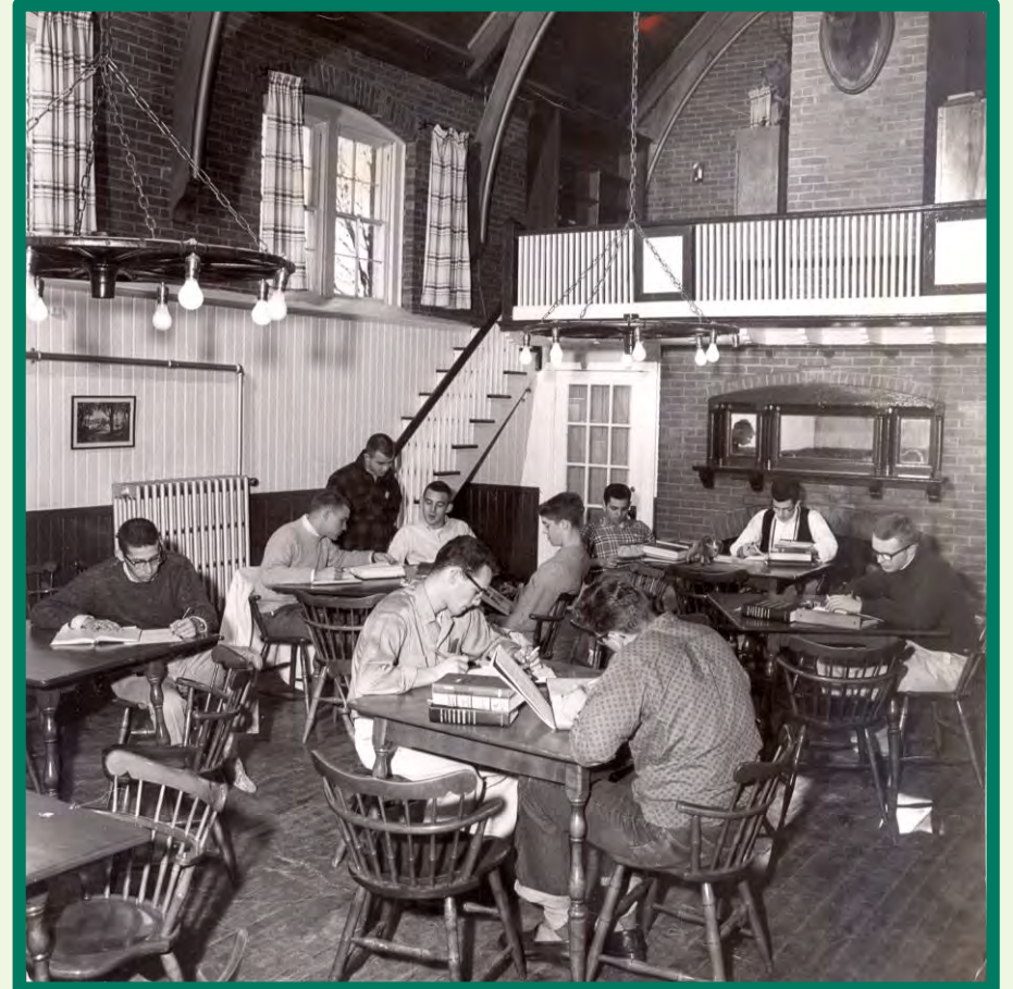
Photo of library in Academy Hall

From 1955 to 1962 the library was located in Conrad Hall.